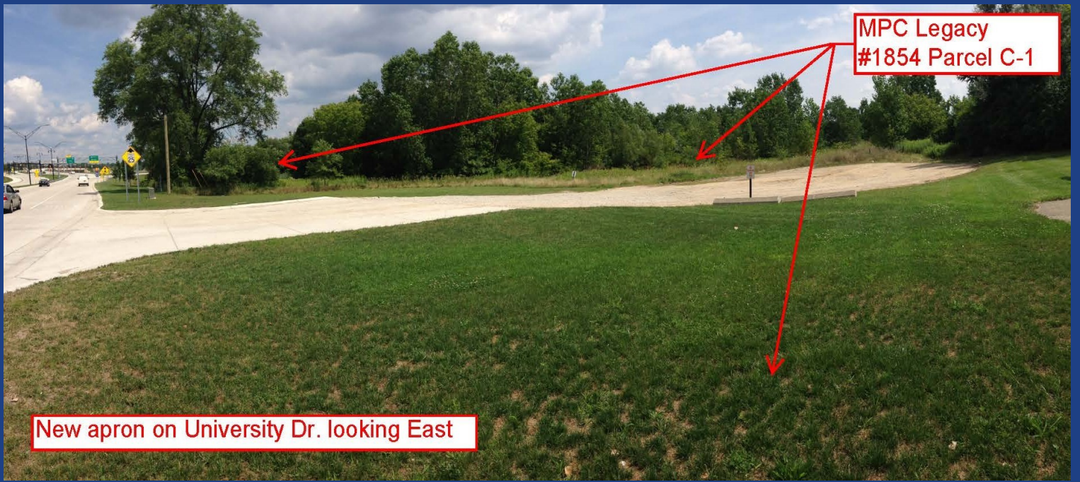
New apron on University Dr. looking East

Unaddressed; adjoins 2100 University Dr., Auburn Hills, MI